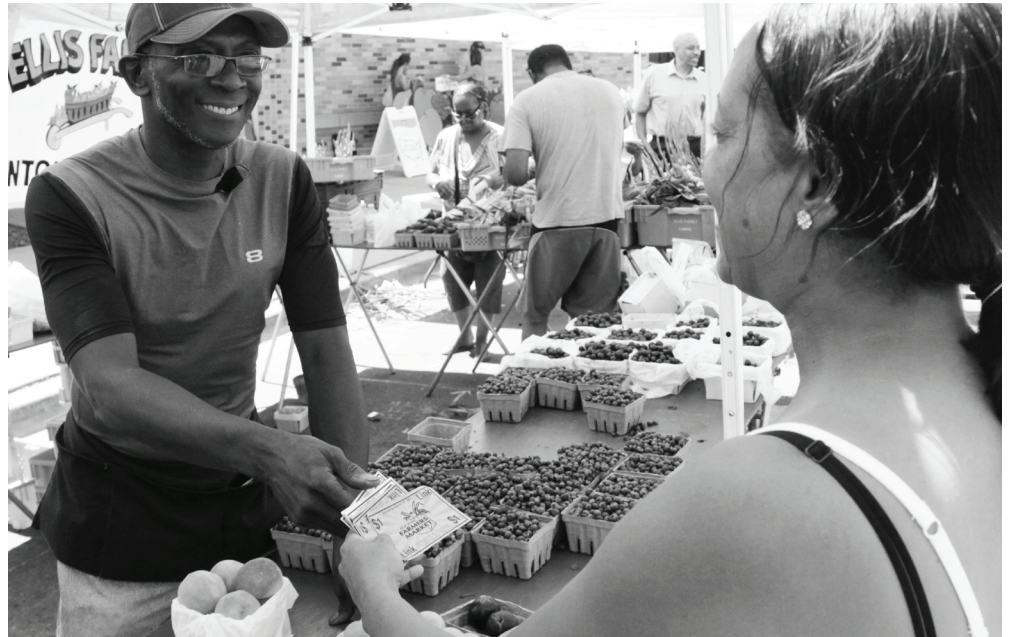
Al from Ellis Farms happily accepts Double Value Coupons at our 61st Street Farmers Market. Doubling the buying power of LINK card holders is a win for low-income shoppers and local small farms alike.

Our kids also got plenty of opportunities to practice on their new bikes, riding to swimming lessons at the Woodlawn Harris Park pool, parading with Blackstone Bikes in the Bud Billiken Parade, riding the lakefront path, and participating in a bike safety workshop led by the University of Chicago's bike-mounted police officers. Now the official service shop for the new UCPD bike fleet, Blackstone is pleased to offer a unique context for our youth and the police to interact, sharing their knowledge while building mutual trust.