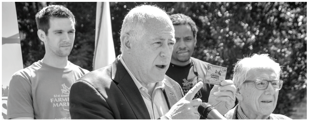
Illinois Governor Pat Quinn visited the 61st Street Farmers Market this summer to endorse our LINK Up Illinois program and spread the good word across the state.

In the infancy of the market, farmers committed not because money was guaranteed, but because they supported our mission of providing good, fresh, local food for all people. Our pair of '1,000' milestones reached this year demonstrate that it is now both financially sustainable and socially desirable to sell at 61st Street.