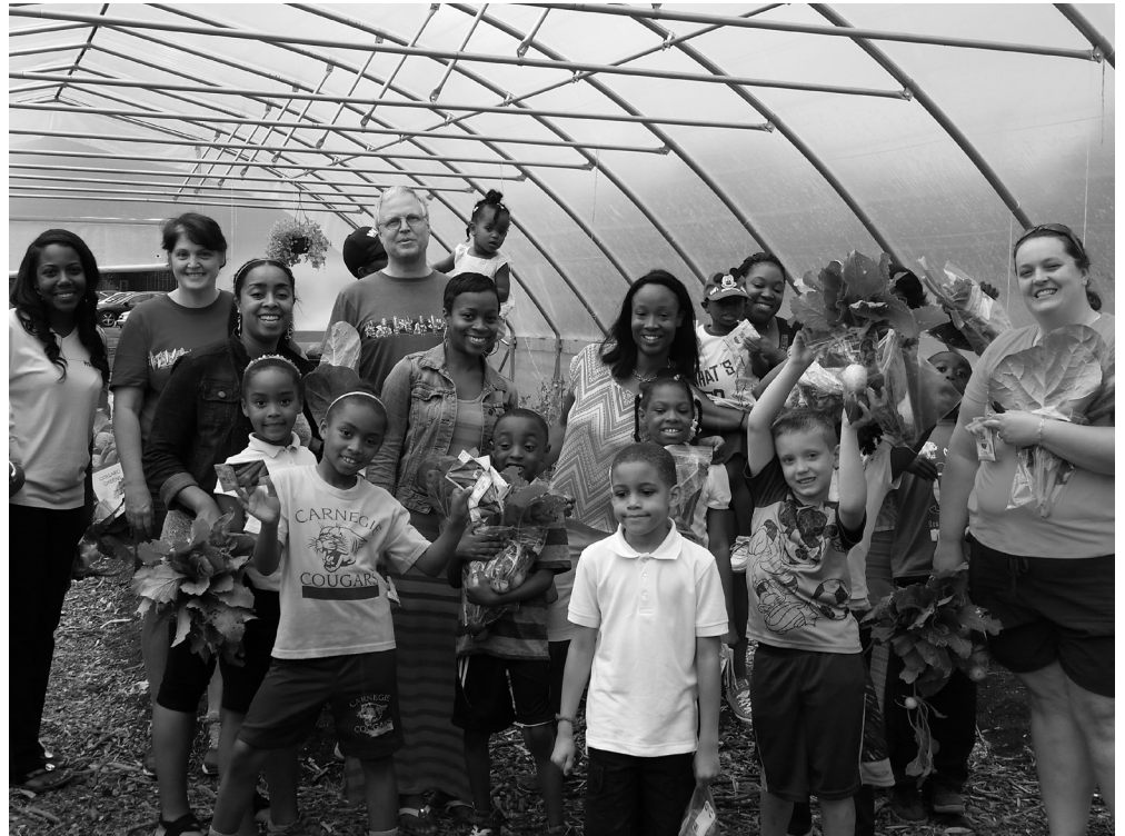
Families of Carnegie Elementary School students who participated in the classroom garden program came after school for an end of school year garden day where they harvested produce, tasted recipes using the freshly picked produce, and learned from their students about what they did in the garden during the school year.