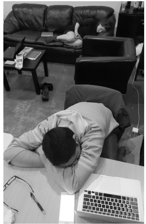
The South Side Weekly's Monday production nights can often go quite late!