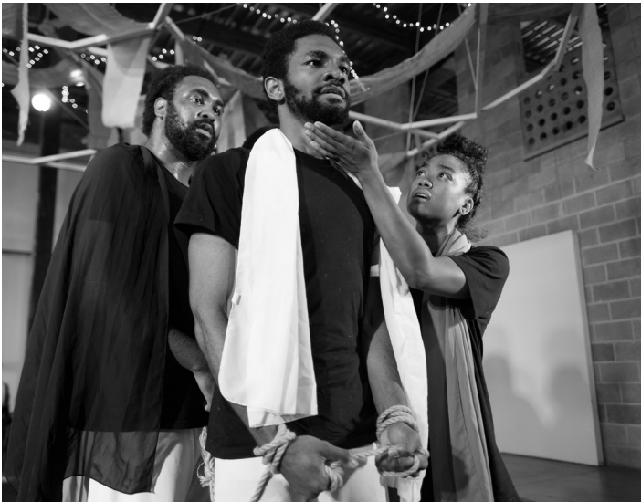
To The Sea by Nik Whitcomb

Experimental Station is investing in building arts infrastructure with a focus on supporting emerging and under-represented Black artists. With over 80 performances, screenings, exhibitions, and convenings in 2019, we've amplified more voices than ever before. These two profiles feature relationships Experimental Station has nurtured over the past year that exemplify the unique ways we foster the arts on Chicago's South Side.